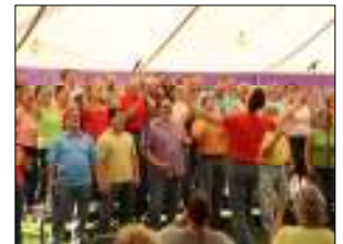
Chilhowee Hills Bpt.

That is exactly what took place here at the corner of Mary and Linden streets on June 5th-8th. Area ministers came together for four nights of boldly announcing the Word and proclaiming the promises of God in the hearing of those that would be saved.